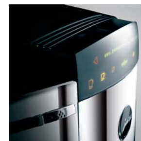
Sensitive Touchscreen Technology®