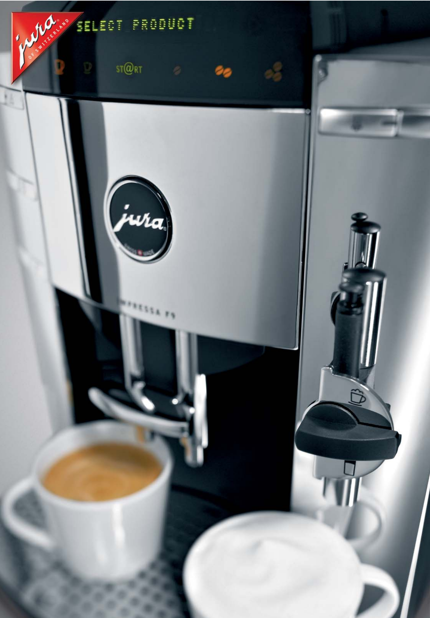
IMPRESSA F9 Chrom