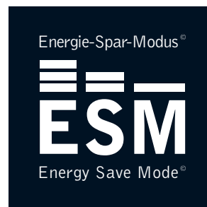
Energy Save Mode®