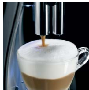
One Touch Cappuccino